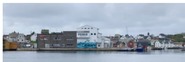
Vestre Vågen, Fedje, guest berths below mural on former fish factory John Sadd

Mooring fees could only be paid by Vipps (with a Norwegian credit card) in 2022.