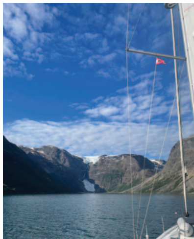
Jøkelfjord at midnight in early July Will Eaton

Good holding off Vika at 70°04'·3N 21°59'·2E; 8–10m. Local moorings and steep shelving make access to the anchorage marked 'J' tricky for more than 1 yacht. 'Ecopod' style hotel on the beach at Jøkelfjordeidet (position given in the book).