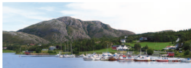
Sandnes hammerhead guest berths Wave-breaker port hand on entry. Fuel berth extreme right John Sadd

Guest pontoon in first marina on SE side of inlet. 25m hammerhead. 8m. Water, electricity. Most other berths occupied by locals. Supermarket. Fuel (petrol, diesel) on Coop pontoon. Exposed to N.