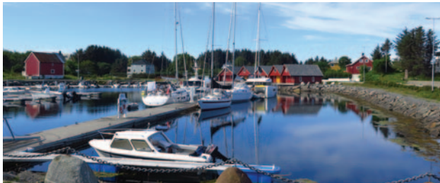
Finnøya, Harøyfjord guest pontoon

Mole harbour on NE corner of Finnøya at the top of Harøyfjord, connected by causeway to larger Harøya to its SW. Entered from N. Long guest pontoon and small boat marina in sheltered SW end; water, electricity; honesty box. Although this is charted as drying, 4m minimum has been experienced on the guest pontoon. Hostel. Clubhouse. Hotel. Marine engine museum (there was formerly a fishing boat engine factory on Finnøy).