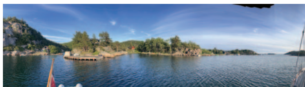
Panoramic view of Tjømshavn looking E from the anchorage Hamish Wilson

New TJØMSHAVN (SØVRINSKILEN) 58°01'·9N 7°18'·14E Enclosed mainland anchorage NW of Hille. Charted depth 3–6m. Good holding in mud. It might be possible to continue NW into Tjømsvåg, lagoon approached either side of Tommodshalmen (charted TO, or not named) (1·9m to its W, unmarked 0·6 and 0·9m rocks off its NW coast; 1·4m in channel to its E). S pool has 4m, mud; N pool 7m. Both Tjømshavn and Tjømsvåg are completely sheltered.