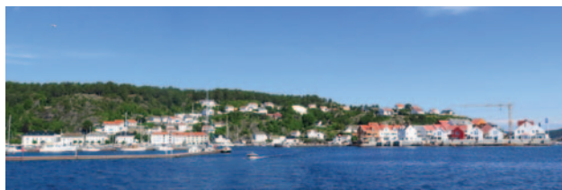
Risør, outer side of long visitors' pontoon, subject to wash from small boat traffic

Holmen yard and workshop have gone. New apartment buildings. Outer berths on guest pontoons subject to swell during the day from small boat traffic passing outside the harbour. Marina exposed to S and SW. Music festival.