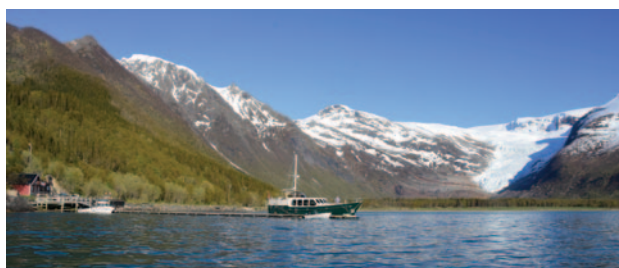
Engen, Holandsfjord: pontoon which has replaced the one shown in the book

See photo of pontoon which has replaced the one shown in the book. Electricity on pontoon, water at head of pontoon. Root end of pontoon on S side reserved for tripper boats.