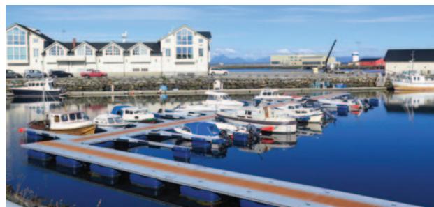
Steinshamn NE Harøya, guest pontoons John Sadd

Harbour on NE side of N tip of island at the top of Harøyfjord. Protected by breakwaters either side of entrance at position given. Small marina in NW corner, 2·3–3·1m alongside 80m-long NE visitors' quay, but possibly only 1·8m on approach past northernmost small boat pontoon; water and electricity. Small boat pontoons have less depth. Commercial harbour on W side of outer harbour, S of entry; anchoring would impede manoeuvring. Shops in Steinshamn village ½ mile away.