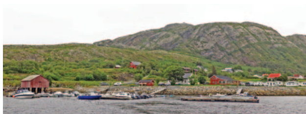
Utvorda hammerhead seen from exposed entrance John Sadd

Not yacht-friendly. Hammerhead nearest harbour entrance is exposed. Unlikely to be space on the three main pontoons. Short (6m) pontoon off quay.