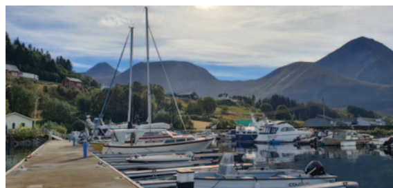
Sætre (Vartdal) Hans-Petter Sandseth

The village is Sætre. The marina is Vartdals Småbåtlag. N/S concrete pontoon. Moor on E and N sides. Toilet in service building. Pay by VIPPS.