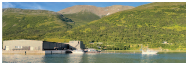
Pontoon halfway up Nord Lenangen Will Eaton

Pontoon with water and electricity on S side of wooden fishing pier on point halfway up fjord. Depth on outer side c.10m. Anchor in 8m.