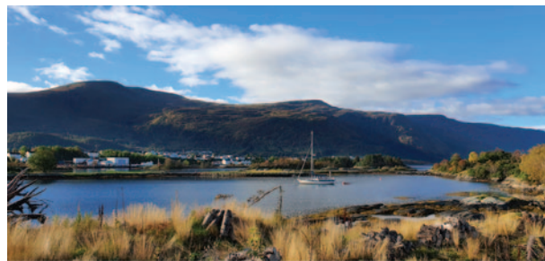
Gåsholm/Flatholm lagoon Hans-Petter Sandseth

62°27'·N 6°12'E Sheltered lagoon S of Flatholm and Gåsholm to N, entered from S between Tennholm and Bukholm (neither named on chart). Anchor, avoiding charted wreck and underwater cable to E between Gåsholm and Sula N coast; 3–14m.