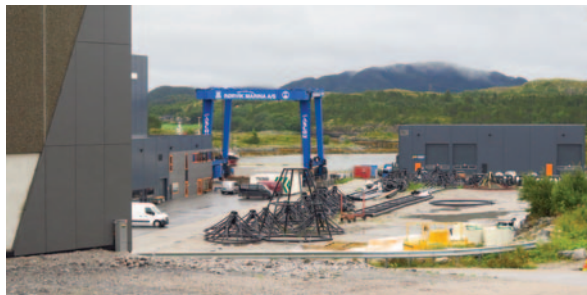
Rørvik Marina AS yard, Marøya. Maintenance and winter storage under cover or outside