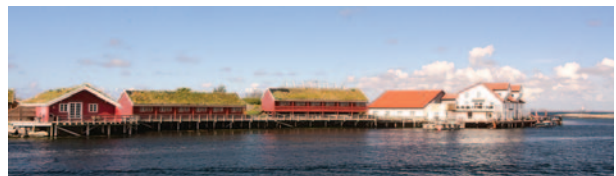
Ringholmen during restoration John Sadd

In summer 2022 the restaurant appeared to be closed, with signs of restoration or rebuilding work.