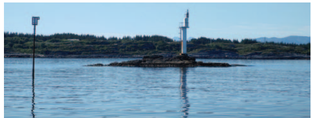
Ersholmen behind Dubla light and marker