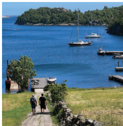
Hillevågen looking SE into the anchorage Hamish Wilson

Anchorage in bight on E side of island Hille. Open to SE. Anchoring depths near the head. Best shelter in S bay N of Kammershammeren. Concrete jetty and some habitation and jetties at head.