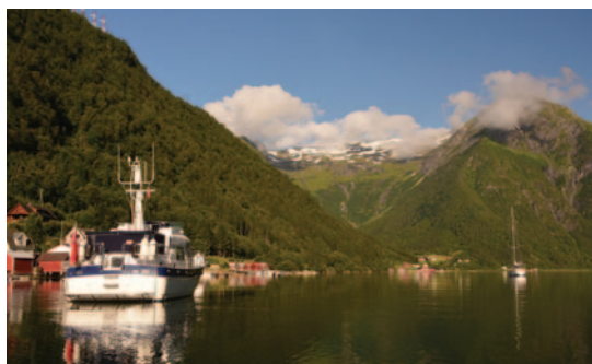
Esefjord, Balestrand small boat harbour and fjord anchorage