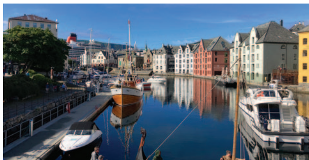
Ålesund harbour looking SW towards bridge at far end of Brosund John Sadd

Harbour wall: the harbour walls now not consisting of pontoons are reserved for large vessels.