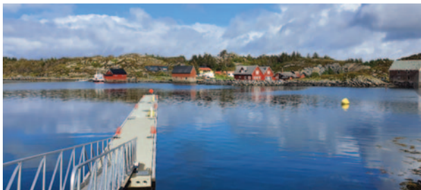
Pontoon at Hamnevågen, Sandøy Hans-Petter Sandseth

New concrete pontoon; c.120m long, to W on port side after mole. Electricity and water.