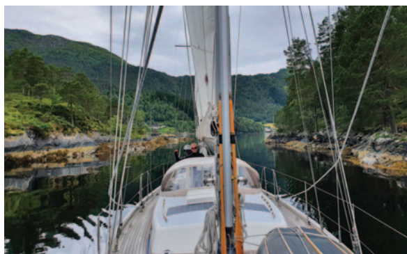
Narrow passage S of Remøya to avoid Aursund 16m bridge John Lancaster-Smith

Add The 16m bridge near the N end of Aursund can be avoided by passing W of the island Røtøya. 28m bridge. The passage S of the island is narrow (27m), depth charted 2·5m.