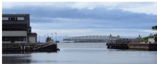
Pedestrian swing bridge, Fosnavåg, looking NW towards the harbour entrance John Sadd

Swing bridge across harbour entrance; mainly open but closes for pedestrians. Marked by flashing orange lights. Electricity and water on guest pontoons. Fuel (diesel, petrol) on first pontoon to starboard after mole. Rimøy should be Remøya.