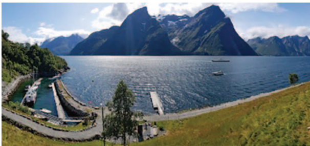
Christian Gaard, hotel/restaurant marina and outer pontoon Hans-Petter Sandseth

62°15'·18N 6°30'·2E E side, 5M up fjord. Christian Gaard guest marina. In calm weather, boats can moor along outer pontoon. Electricity. Toilet, shower. WiFi. Fuel to N; credit and debit cards. Restaurant/hotel water taxis. Summer guests include international artists. Weekend music festivals. Christian Gaard is only accessible by boat and is still owned by the same family as 500 years ago. ☎ + 47 907 20 172 christian-gaard.no/en/