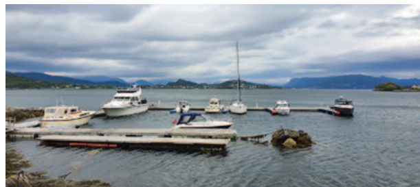
Gåsholm, Ålesund Seilforening Seilerhytte marina Hans-Petter Sandseth

E side of largest and furthest N of the islands. Seilerhytte marina belonging to Ålesunds Seilforening. Visitors welcome. SW/NE guest pontoon (at position given). 6m. Water. Electricity. Mooring buoys. Former trading post. Footpaths. Beach. At low water it is possible to walk to Flatholm.