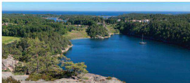
View S over Lusekilen from the top of Videheia to its N Hamish Wilson

Anchorage N of the Blindleia, SSE of Ingridnes. Anchor near head in 10m; mud . Good view from top of Videheia to N.