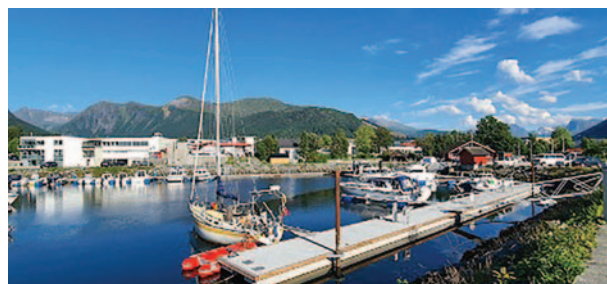
Ørsta guest pontoon, boats to 40ft Hans-Petter Sandseth

62°11'·88N ·N 6°07'·2E At head of 5M Ørsta fjord. Stone mole. Pontoons. Depth to 2·2m, greater than it seems on chart (two 1m spots on small boat pontoons). Yachts to 40ft, depth to 2·2m, on NW pontoon. Water, electricity. Launderette. Fuel (diesel, petrol). Small town with shops, restaurants, hotels; Ørsta-Volda airport 3km. Spectacular mountain surroundings.