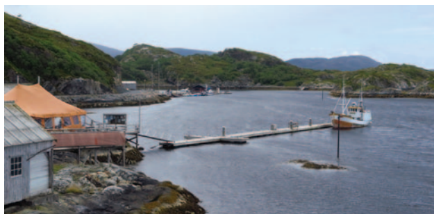
Brakstadhamn, Joa looking west towards harbour which has better shelter than older pontoon in background John Sadd

New BRAKSTADHAMN, JOA 64°40'·4N 11°11'·7E NW corner of Joa. 64°40'·2N 11°11'·35E. Marked entry (position given) E of skerry. 40m pontoon, 8m. Better shelter than older pontoon (in photo in background) below pub/restaurant (shown in photo). Water, electricity. Good cycling/walking. Supermarket in Dun, centre of island (5km).