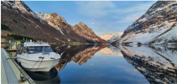
Urke Norangsfjord Hans-Petter Sandseth

New URKE, NORANGSFJORD 62°12'·6N 6°34'·6E Pontoons at W end of Urkebukta bay on N side of Norangsfjord, 1·3M E of junction with Hjørundfjord. Depth 10m. Electricity, water. Pub/café. In summer, local produce can be bought at a local farm. Good day mountain hikes.