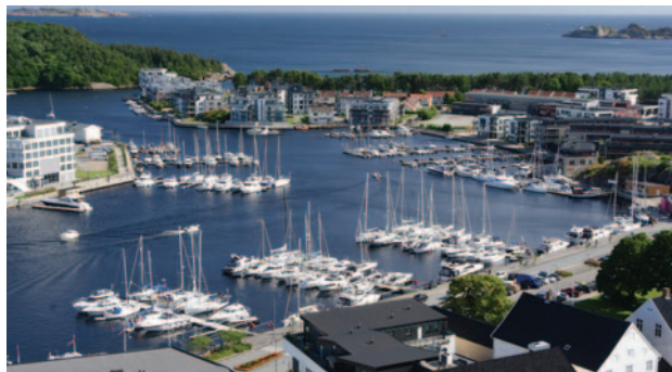
Mandal visitors' pontoons in foreground, looking SE to entrance

Add WWII gun emplacements on the headland Hobdeodden, E tip of the peninsula SW of Mandal river entry above long sandy beach. Marked footpaths.