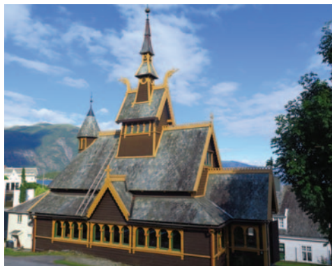
The English church in Balestrand